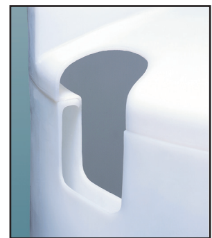
Inner tank dome overlaps outer tank to prevent contamination.