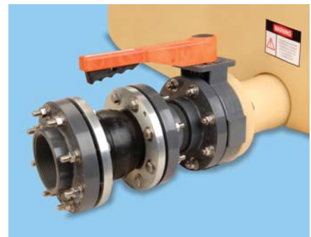
3" FDO (left) and 4" FDO (right) with flanged coupling, butterfly valve, and flexible expansion joint.